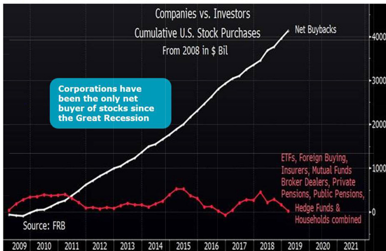
Figure 2: Corporations have been the only net buyer since the GFC